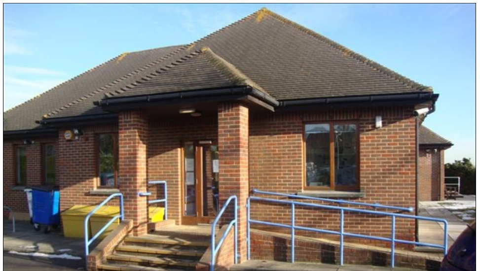
The St Werburgh Medical Practice Bells Lane Surgery in Rochester, Kent.

Opus Business Systems has installed and now maintains the telephone systems at each of the locations and provides call recording, having taken over the maintenance for the previous systems.