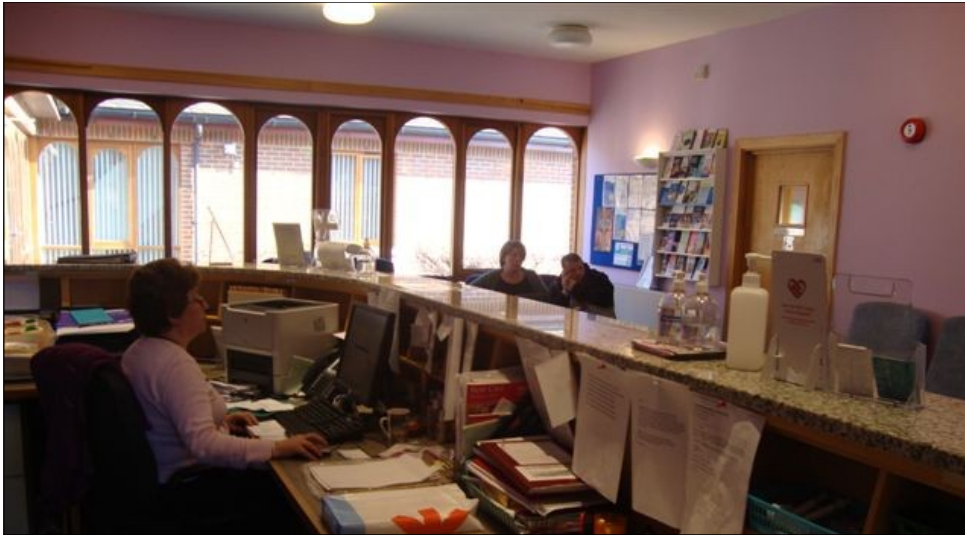
Reception at the St Werburgh Medical Centre