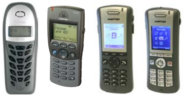
DT190, DT 292, DT 4x2, DT590, DT390 and the DT690

DT390 is a simple phone with modern design, this is the choice for the pure office environment.