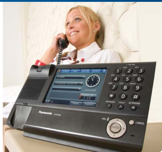
KX-NT400 EXECUTIVE IP TELEPHONE BROCHURE