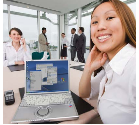
COMMUNICATION ASSISTANT BROCHURE